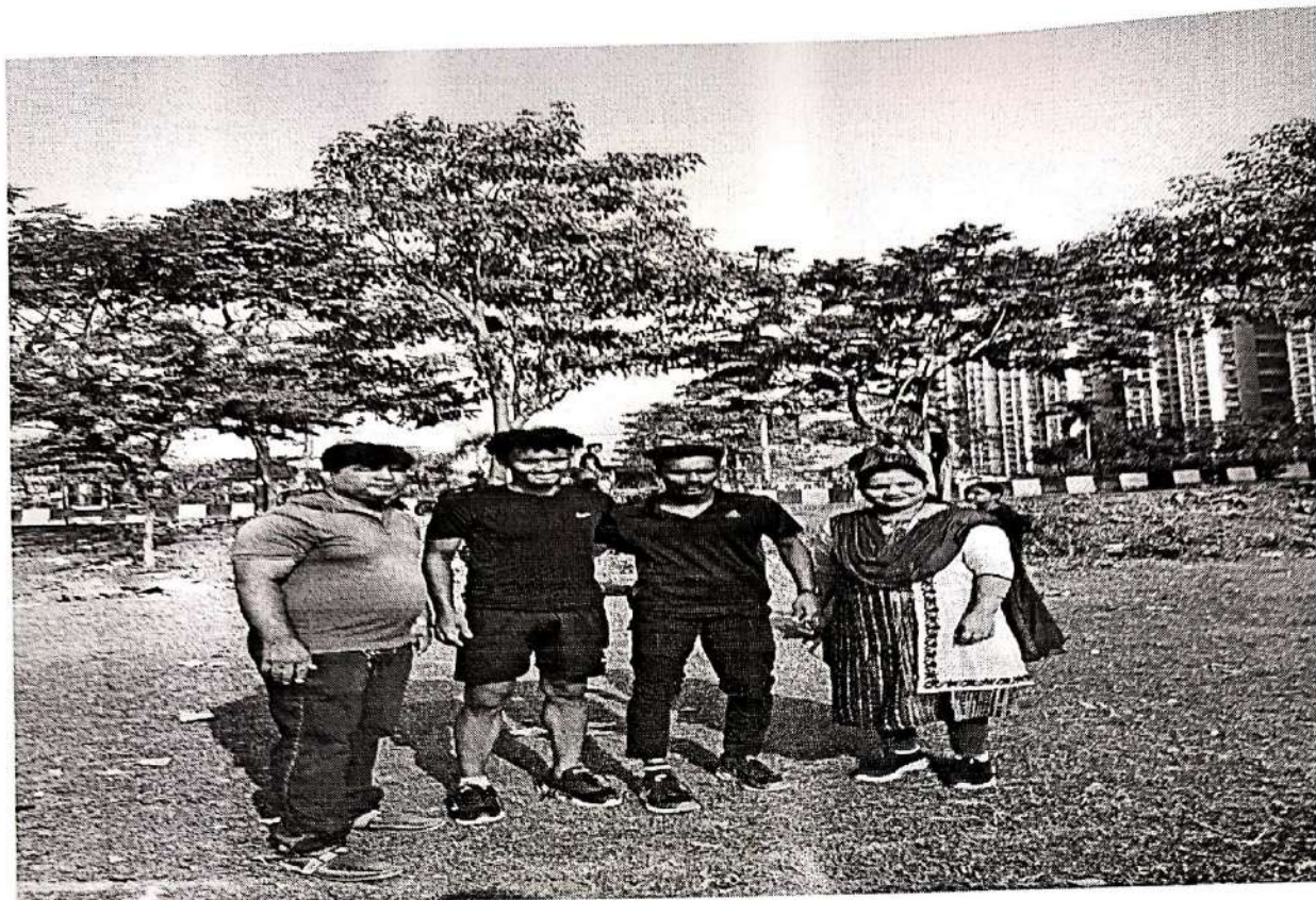
200 Meter Running